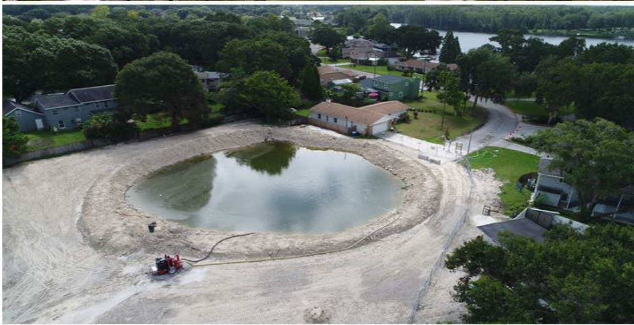
Then And Now