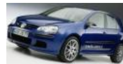
VW Golf TwinDrive