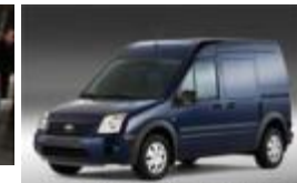
Ford Transit Connect