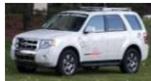
Ford Escape PHEV