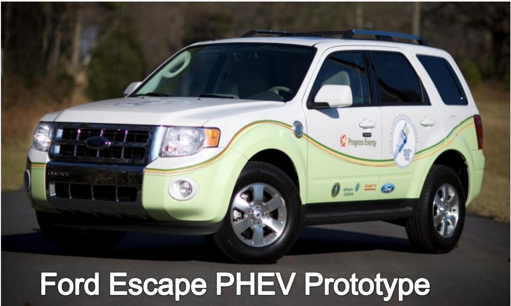
Ford Escape PHEV Prototype