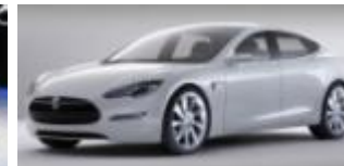
Tesla Model S